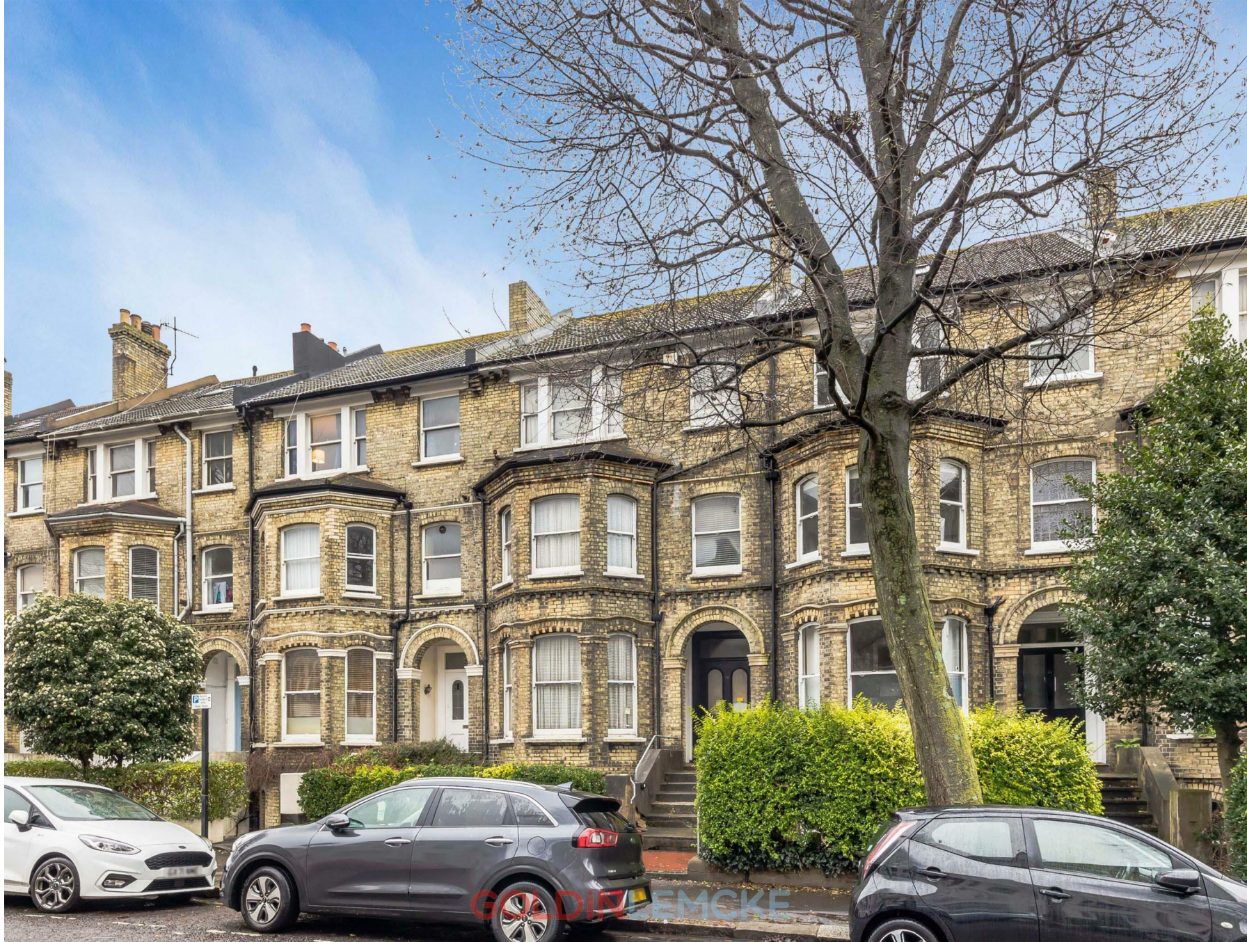
Denmark Villas, Hove, BN3 3TJ Guide Price £1,000,000